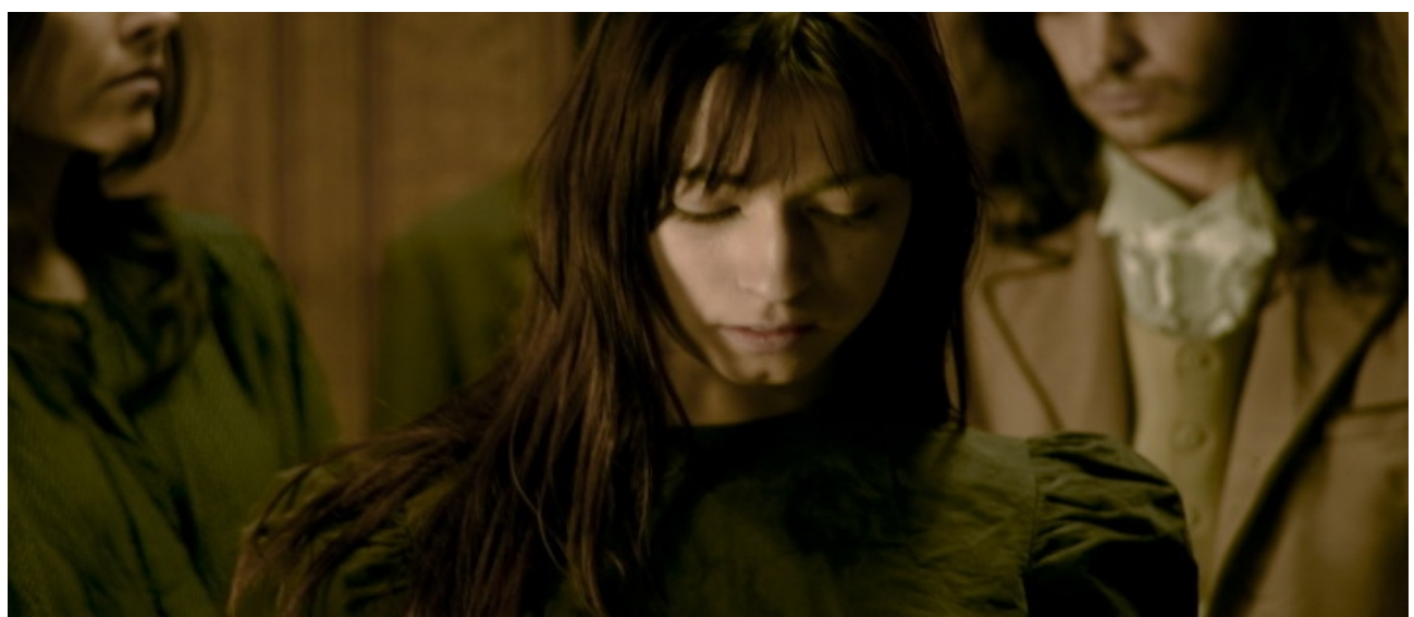
June 21 15.00 – Garage Center for Contemporary Culture: the world premiere of "Pitter Patter" video by Provmyza group;

The plot of the video is based on the famous photograph by the well-known English photographer Henry Peach Robinson who created his works in the middle of the nineteenth century. The action is centered around the sick girl lying in bed and the crowd of people who have come to bid farewell to the dying girl. The sunlight and wind with their metaphysical qualities, which keep appearing in the room throughout the plot, make it possible to perceive the video work through sensory, existential and poetical associations. The end is not far off. But the living process does not come to an end. It takes the shape of water which slowly fills the bed and, in a way, continues the sentimental and lyrical plot, running pitter-patter.